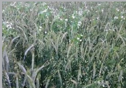
3 June 2014