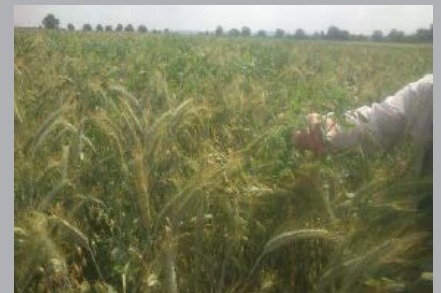
18 June 2014